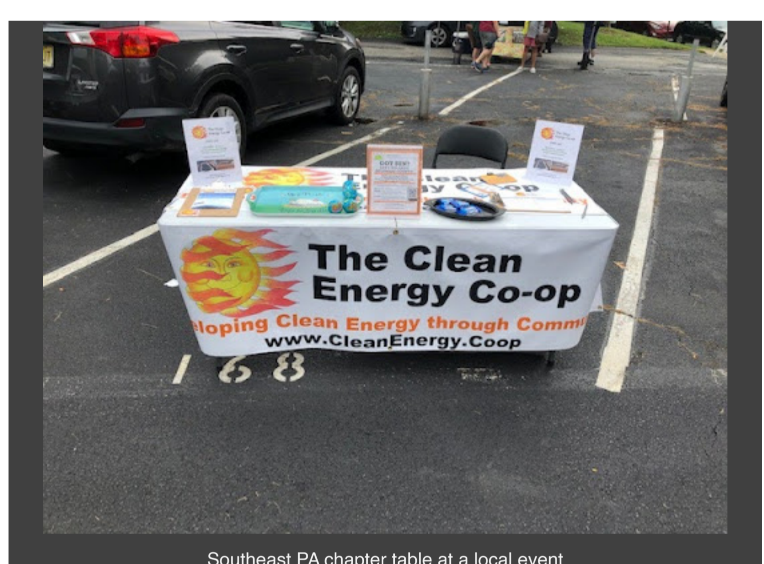
Southeast PA chapter table at a local event

We are hosting a 'Get to Know Us' event on Wednesday, December 8 on Zoom. Now that the Chapter has been operational for over 6 months, we plan to highlight the progress the Co-op has made since then with focus on the SEPA chapter creation, the Co-op's PEC award last week, and the really strong possibility of a solar installation project with a local school district.